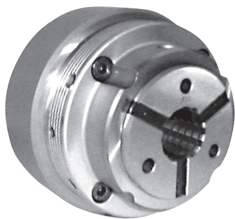
GRUPPI ACCESSORI PASSAGGIO "PEL" OPTIONAL KIT WORKPIECE CONTROL